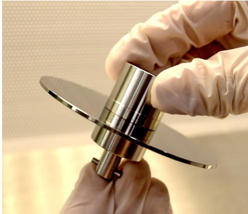
Picture 4.2. Position of the platter in the Platter Carrying Assembly

After the platter is properly positioned on the lower shell, gently wind down the upper shell until you sense it touching the platter. Repeat this procedure for every Platter Carrying Subassembly . The platter is secured between the lower and the upper shell like on the picture bellow.