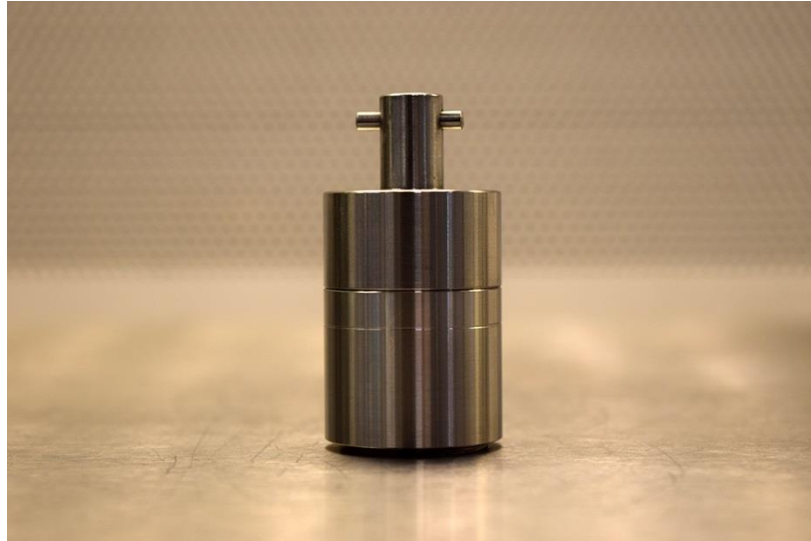
Picture 2.2. The Platter Carrying Assembly

Upper shells are marked with a number of engraved rings, helping the data recovery specialists differentiate them thus disabling the possibility of mixing up the order of the platters stored in the Platter Carrying Assemblies .