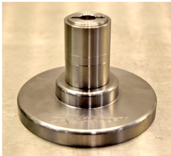
Picture 3.2. Base with the added Platter Carrying Assembly

Start with the base. Attach the first Platter Holding Assembly into the hole in the middle of the base. After this point, it is all about stacking the Platter Carrying Assemblies atop of one another.